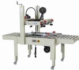
FXJ6060 / FXJ8060 Carton Sealing Machine 半自动封箱机 Power Supply/供给电源: 110V/220-240V/50-60Hz Power/功率: 240W Max. Carton Size/最大纸箱尺寸: W600xH600mm (FXJ6060) Max. Carton Size/最大纸箱尺寸: W600xH800mm (FXJ8060) Min. Carton Size/最小纸箱尺寸: W150xH120mm Width Of Tape/胶带宽度: 50mm or 60mm or 75mm