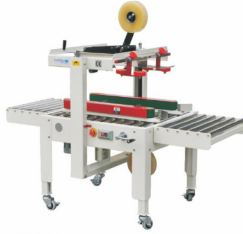
FXJ6050H Carton Sealing Machine 半自动封箱机 Power Supply/供给电源: 110V/220-240V/50-60Hz Power/功率: 180W Conveyor Speed/输送速度: 20m/min Max. Carton Size/最大纸箱尺寸: W500xH500mm Min. Carton Size/最小纸箱尺寸: W100xH100mm Width Of Tape/胶带宽度: 50mm or 60mm Machine Size/机器尺寸: 1660x850x1260mm Option: 3inch tape & overlap (Model FXJ6050/3)