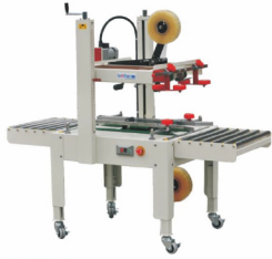
FXJ6050 Carton Sealing Machine 半自动封箱机 Power Supply/供给电源: 110V/220-240V/50-60Hz Power/功率: 180W Conveyor Speed/输送速度: 20m/min Max. Carton Size/最大纸箱尺寸: W500xH600mm Min. Carton Size/最小纸箱尺寸: W150xH120mm Width Of Tape/胶带宽度: 50mm or 60mm Machine Size/机器尺寸: 1630x800x1330mm Option: 3inch tape & overlap (Model FXJ6050/3)