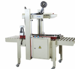
AS823A (Random Model) Carton Sealing Machine for Random size box 半自动封箱机(自动尺寸调节款) Power Supply/供给电源: 110V/220-240V/50-60Hz Power/功率: 240W Conveyor Speed/输送速度: 20m/min Max. Carton Size/最大纸箱尺寸: W500xH500mm Min. Carton Size/最小纸箱尺寸: W150xH120mm Width Of Tape/胶带宽度: 50mm or 60mm Air Source/气源: 0.4-0.8Mpa & 450l/min.