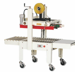
AS123 (Top Sealing Model) Carton Sealing Machine 半自动封箱机 Power Supply/供给电源: 110V/220-240V/50-60Hz Power/功率: 180W Conveyor Speed/输送速度: 20m/min Max. Carton Size/最大纸箱尺寸: W500xH600mm Min. Carton Size/最小纸箱尺寸: W100xH100mm Width Of Tape/胶带宽度: 50mm or 60mm Machine Size/机器尺寸: 1545x815x1475mm