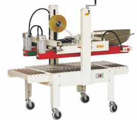
AS323 (Auto. Flap-folding Model) Carton Sealing Machine 半自动封箱机 Power Supply/供给电源: 110V/220-240V/50-60Hz Power/功率: 180W Conveyor Speed/输送速度: 20m/min Max. Carton Size/最大纸箱尺寸: L600xW450xH600mm Min. Carton Size/最小纸箱尺寸: L150xW160xH100mm Width Of Tape/胶带宽度: 50mm or 60mm Machine Size/机器尺寸: 1910x870x1535mm