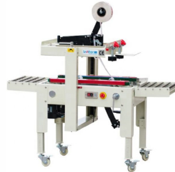
FXJ4030D Carton Sealing Machine for E-commerce Box 半自动封箱机(电商款) Power Supply/供给电源: 110V/220-240V/50-60Hz Power/功率: 120W Conveyor Speed/输送速度: 20m/min Max. Carton Size/最大纸箱尺寸: W300xH400mm Min. Carton Size/最小纸箱尺寸: W80xH40mm Width Of Tape/胶带宽度: 48mm or 50mm