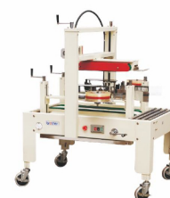
AS423 (Side Sealing Type) Carton Side Sealing Machine 半自动封箱机(侧封款) Power Supply/供给电源: 110V/220-240V/50-60Hz Power/功率: 180W Conveyor Speed/输送速度: 20m/min Max. Carton Size/最大纸箱尺寸: W500xH500mm Min. Carton Size/最小纸箱尺寸: W150xH70mm Width Of Tape/胶带宽度: 50mm or 60mm Machine Size/机器尺寸: 1100x900x1320mm