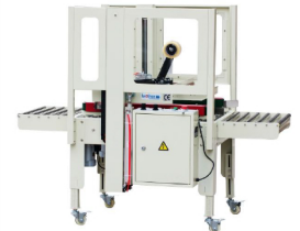
AS823B (Random Model) Carton Sealing Machine for Random or fixed box 半自动封箱机(自动尺寸调节或固定尺寸) Power Supply/供给电源: 110V/220-240V/50-60Hz Power/功率: 240W Conveyor Speed/输送速度: 20m/min Max. Carton Size/最大纸箱尺寸: W500xH500mm Min. Carton Size/最小纸箱尺寸: W150xH120mm Width Of Tape/胶带宽度: 50mm or 60mm Air Source/气源: 0.4-0.8Mpa & 450l/min.