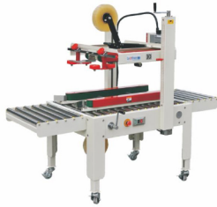
FXJ6050B / FXJ8060B / FXJ9070B Carton Sealing Machine 半自动封箱机 Power Supply/供给电源: 110V/220-240V/50-60Hz Power/功率: 270W Max. Carton Size/最大纸箱尺寸: W500xH600mm(FXJ6050B) Max. Carton Size/最大纸箱尺寸: W600xH800mm(FXJ8060B) Max. Carton Size/最大纸箱尺寸: W700xH900mm(FXJ9070B) Min. Carton Size/最小纸箱尺寸: W150xH120mm Width Of Tape/胶带宽度: 50mm or 60mm or 75mm