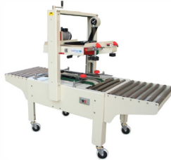
BCS5050 Heavy Duty Carton Sealing Machine 半自动封箱机 Power Supply/供给电源: 110V/220-240V/50-60Hz Power/功率: 200W Conveyor Speed/输送速度: 18m/min Max. Carton Size/最大纸箱尺寸: W500xH500mm Min. Carton Size/最小纸箱尺寸: W120xH120mm Width Of Tape/胶带宽度: 50mm or 60mm