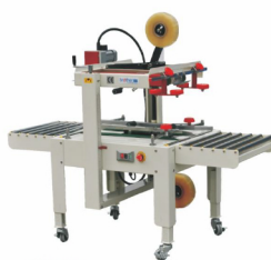
FXJ5060H Carton Sealing Machine 半自动封箱机 Power Supply/供给电源: 110V/220-240V/50-60Hz Power/功率: 180W Conveyor Speed/输送速度: 20m/min Max. Carton Size/最大纸箱尺寸: W500xH500mm Min. Carton Size/最小纸箱尺寸: W100xH100mm Width Of Tape/胶带宽度: 50mm or 60mm Machine Size/机器尺寸: 1630x800x1230mm