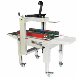
FXJ4030X Carton Sealing Machine for E-commerce Box 半自动封箱机(电商款) Power Supply/供给电源: 110V/220-240V/50-60Hz Power/功率: 180W Conveyor Speed/输送速度: 20m/min Max. Carton Size/最大纸箱尺寸: W300xH400mm Min. Carton Size/最小纸箱尺寸: W80xH90mm Width Of Tape/胶带宽度: 48mm or 50mm