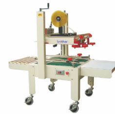
AS223 (Top Sealing Model) Carton Sealing Machine 半自动封箱机 Power Supply/供给电源: 110V/220-240V/50-60Hz Power/功率: 180W Conveyor Speed/输送速度: 20m/min Max. Carton Size/最大纸箱尺寸: W500xH590mm Min. Carton Size/最小纸箱尺寸: W100xH100mm Width Of Tape/胶带宽度: 50mm or 60mm Machine Size/机器尺寸: 1545x815x1475mm