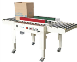
FX50 / FX60 Carton Bottom Sealing Machine 半自动封底机 Power Supply/供给电源: 110V/220-240V/50-60Hz Power/功率: 180W Max. Carton Size/最大纸箱尺寸: W500mm x H=(FX50) Max. Carton Size/最大纸箱尺寸: W600mm x H=(FX60) Min. Carton Size/最小纸箱尺寸: W100xH100mm Width Of Tape/胶带宽度: 50mm or 60mm