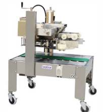
AS623 (Suit for Bubble Box) Carton Side Sealing Machine 半自动封箱机(气泡箱款) Power Supply/供给电源: 110V/220-240V/50-60Hz Power/功率: 240W Conveyor Speed/输送速度: 20m/min Max. Carton Size/最大纸箱尺寸: W500xH430mm Min. Carton Size/最小纸箱尺寸: W280xH100mm Width Of Tape/胶带宽度: 50mm or 60mm