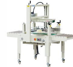
AS423B (Side Sealing Type) Carton Side Sealing Machine 半自动封箱机(泡沫箱款) Power Supply/供给电源: 110V/220-240V/50-60Hz Power/功率: 180W Conveyor Speed/输送速度: 20m/min Max. Carton Size/最大纸箱尺寸: W500xH500mm Min. Carton Size/最小纸箱尺寸: W150xH70mm Width Of Tape/胶带宽度: 50mm or 60mm Machine Size/机器尺寸: 1900x900x1320mm